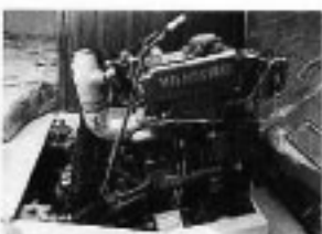
18 HP Yanmar diesel is standard, a 9 HP version is optional. Both afford great accessibility.