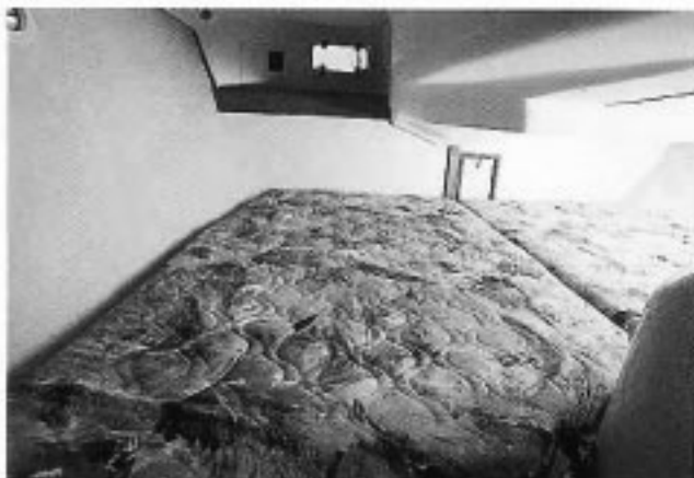
Aft stateroom provides comfortable and private sleeping accommodations with good ventilation.