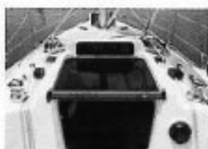
Instrument pod keeps your electronics where you need them.