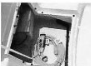
Abundant storage for lines, cords and more.