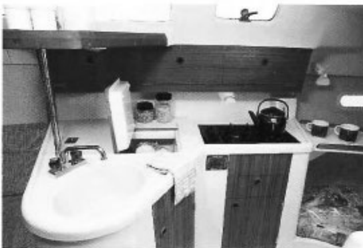
A complete galley with 2-burner stove, icebox, sink, cutting board and storage helps in putting together a quick snack or a full gourmet meal.