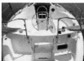
Standard wheel steering