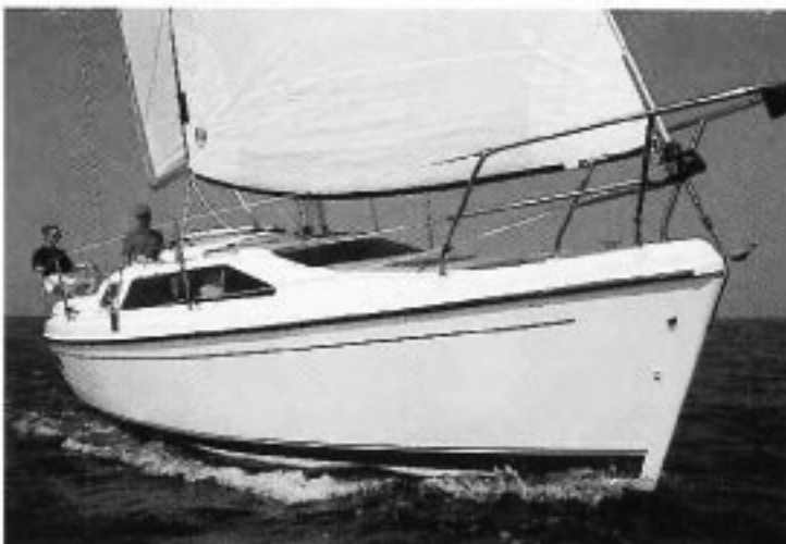
The innovative Hunter windshield, large windows, and plenty of opening ports and hatches provide excellent light and ventilation.