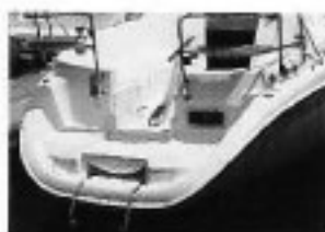
Optional tiller steering available.