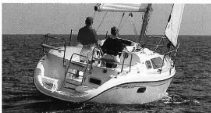
A walk-through transom, integrated swim platform, and swim rail with anchor make the 280 transom really functional.

For power, you can choose from two inboard diesel engines. And depending on your cruising needs, you can choose a shoal or