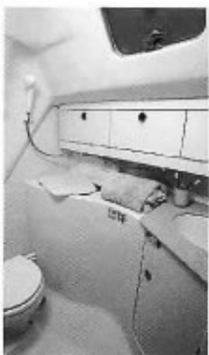
Private head with shower and molded vanity.

W hile everyone else was complaining about the high cost of marine hardware and accessories, Hunter was doing something about it. The Hunter Cruise Pac ® was developed to make all the accessories and hardware you need standard equipment. We buy top-quality gear in very large quantities. The result? Equally large savings. The Hunter 280 Cruise Pac ® isn't just sails, winches, and running rigging – it's things like anchor, fire extinguisher, life jackets – even a copy of Chapman's Piloting, Seamanship, and Small Boat Handling. We invite you to compare the Standard Equipment list below with that of any other manufacturer. You'll discover that Hunter is going the distance for you with more – and better gear. For less.