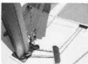
All lines lead aft for short-handed sailing.